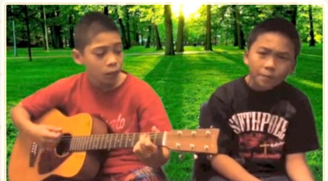
Bragg ES - Don't Be a Cyberspace Bully from ABC Unified School District PLUS 1 month ago