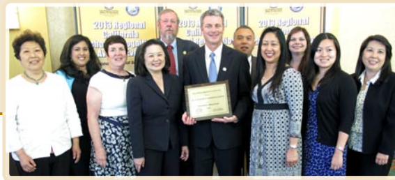
Celebrating with the Gonsalves ES Staff