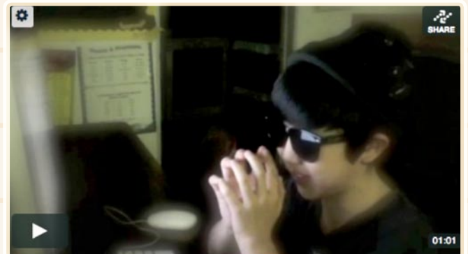
Bragg ES - Cyberspace Stranger Danger from ABC Unified School District PLUS 1 month ago

www.abcusd.k12.ca.us > CyberSmart Month - October ▶