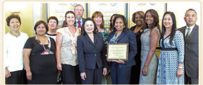
Celebrating with the Tetzlaff MS Staff