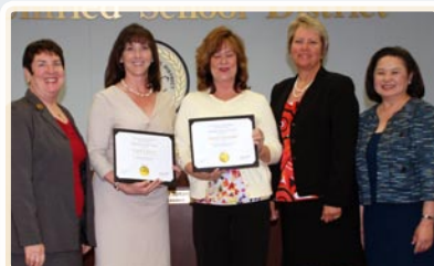
Honoring Schools First Credit Union