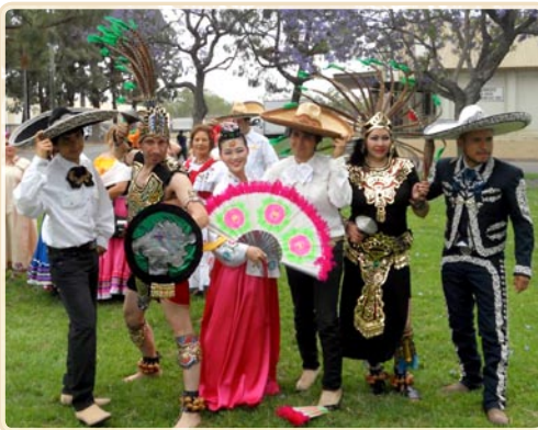
Korean fan dance with the Aztec drum dance - a truly intercultural moment.

the audience collectively rushed forward, smartphones and cameras in hand, cheering wildly as they tried to capture the moment. Several students jumped into the area in front of the stage to dance along. When the song ended, everyone called for an encore—though, as most of our ESL students did not know the word, most simply shouted, "Do it again!" And so they