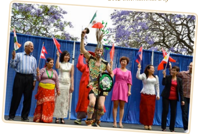
31 countries were represented at 2013 International Day

did it again. What a treat to see our Aztec drum dancer, beads and loincloth and all, jump on stage and dance along! More students from various country groups got on stage also—a truly intercultural moment. ▶