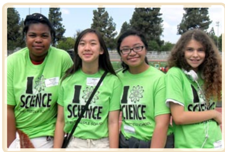
Ross MS Science Students

On Saturday, May 18 th , the District held the 15 th Annual Middle School Science Olympics at Fedde MS. This year, the focus was on STEM events organized by the District Middle School STEM Olympics Committee.