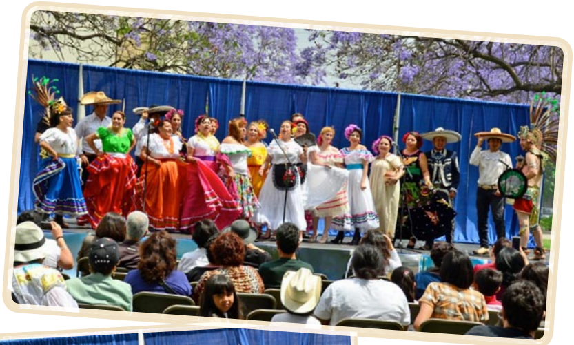
Cielito Lindo and Aztec Dance were the big hit for the day.

The show-stopper was the final act—a group of Korean students performing "Gangnam Style". One of these very hip performers is 85 years young! The performance was so spectacular that