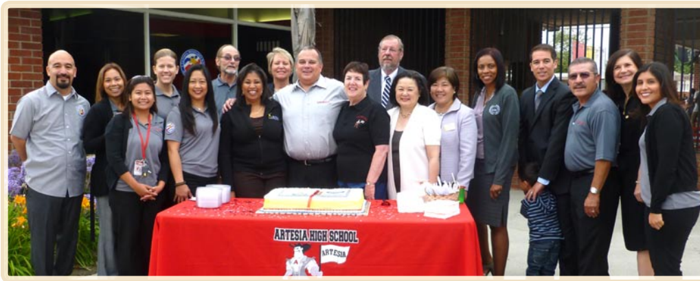
Flag Ceremony at Artesia HS for becoming a California Distinguished School

It's difficult to imagine that this school year is coming to an end. It's been an exciting year for our schools. There are great things happening in our schools every day and the upward climb of our graduation rates bears that out. We recognize that we are moving in the right direction and must keep moving to ensure that our students are ready to succeed in the world they will find outside our classrooms.